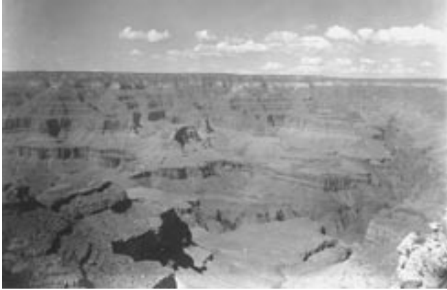
Figure 3. Grand Canyon National Park, Arizona. Grand Canyon, viewed from in front of the El Tovar Hotel. August 30, 1905. Radically varying interpretations of Grand Canyon between uniformitarian and creationist geologists illustrate the role of interpretive templates.

much more than “methodological” uniformitarianism; he safeguarded a uniformity of rate and process (Figure 4).