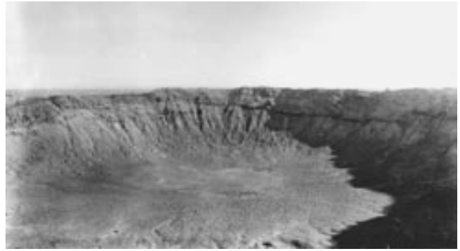
Figure 2. Meteor Crater, Arizona. Crater, viewed from the rim. 1891. For many years, scientists argued the origin of this feature.

Science applies special forms of observation to physical phenomena (i.e., experimentation with controlled repeatability). Experimentation is impossible with reference to the singular events of the past. However, in order to argue against Christianity, Naturalists must be able to both accurately describe history and interpret it (Figure 2). We are often puzzled by events of 100 years ago. Historians fight